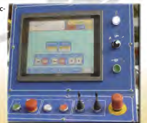
HMI operate interface is conversation to set up, and error message offer easy way for operator to do trouble shooting and maintenance. 人機操作介面，對話式設定，以及故障提示說明，易於操作及維修。