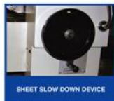
SHEET SLOW DOWN DEVICE