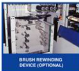
BRUSH REWINDING DEVICE (OPTIONAL)