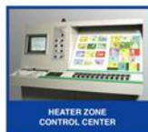
HEATER ZONE CONTROL CENTER