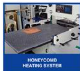
HONEYCOMB HEATING SYSTEM