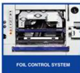
FOIL CONTROL SYSTEM