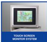
TOUCH SCREEN MONITOR SYSTEM