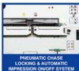
PNEUMATIC CHASE LOCKING & AUTOMATIC IMPRESSION ON/OFF SYSTEM